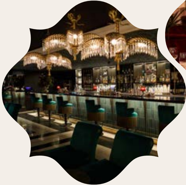
• Bar Space